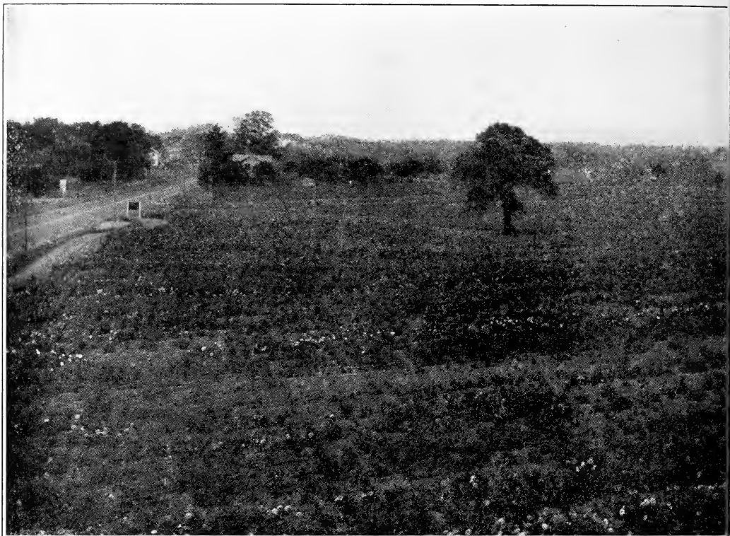
A View, looking west, of Kendal Dahlia Gardens at beginning of bloomtime. 100,000 HILLS AND NOT A SINGLE

If you order "Garden Beautiful" collection on back cover you may select any 50c Dahlia or 1 Tritoma (see page 30) in this catalog FREE as a courtesy.